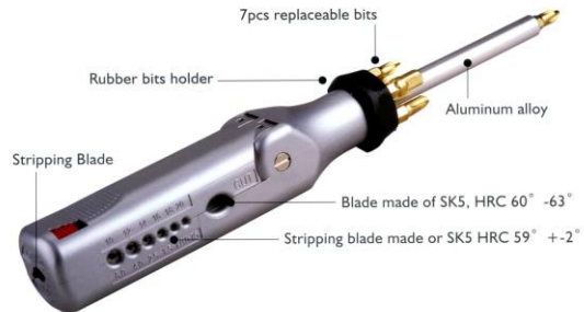
Item No. 625011 MULTI-FUNCTIONS STRIPPER WITH EXTRA SCREWDRIVER