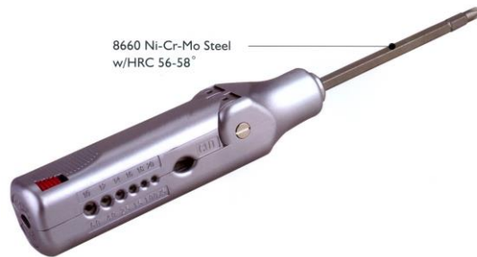
Item No. 625012 MULTI-FUNCTIONS STRIPPER WITH EXTRA SCREWDRIVER