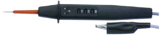
LMCTS-035 CAR CHECK 6-48V W/CE LED DISPLAY SHOWS POLARITY.