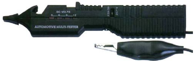
LMCTS-037 BATTERY CHECK/VOLTAGE TESTER W/CE