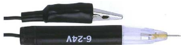
LMCTS-015 LIGHT-TESTER CHECK 6-24V W/CE