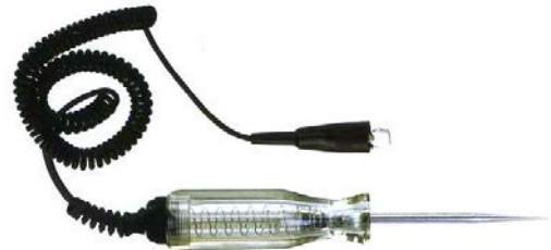
LMCTS-012 HEAVY DUTY CIRCUIT TESTER CHECK 6 & 12V