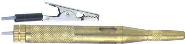
LMCTS-003 CIRCUIT TESTER CHECK 6-24V