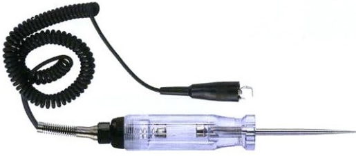
LMCTS-016 LONG PROBE CIRCUIT TESTER CHECK 6-12-24V