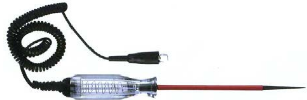
LMCTS-011 LONG PROBE CIRCUIT TESTER CHECK 6 & 12V