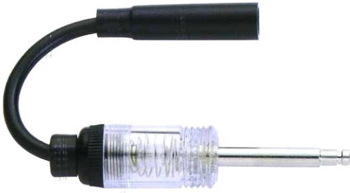
LMCTS-027 IN-LINE SPARK PLUG TESTER W/CE