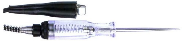
LMCTS-021 HEAVY DUTY CIRCUIT TESTER CHECK 6 & 12V W/CE