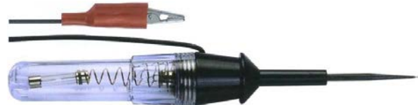
LMCTS-013 DUALITE HIGH AND LOW VOLTAGE TROUBLE SHOOTER CHECKS 6 & 12V, CIRCUIT TESTER & SPARK PLUGS TESTER