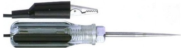
LMCTS-022 CONTINUITY TESTER W/CE