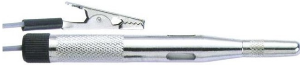
LMCTS-002 CIRCUIT TESTER CHECK 6-24V