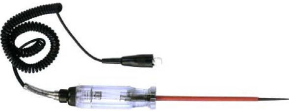
LMCTS-017 HEAVY DUTY CIRCUIT TESTER CHECK 6-12-24V