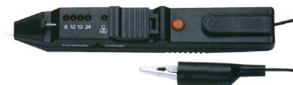
LMCTS-034 AUTOMOTIVE MULTI-TESTER WITH FLASHLIGHT TESTS, 6, 12, 13 OR 24V DC, PLUS HIGH-VOLTAGE IGNITION W/CE