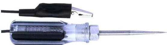
LMCTS-020 COMPUTER-SAFE CIRCUIT TESTER WITH LED POLARITY INDICATOR W/CE