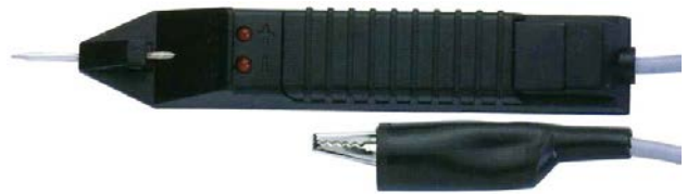
LMCTS-036 AUTO TESTER CHECK 3-48V W/CE