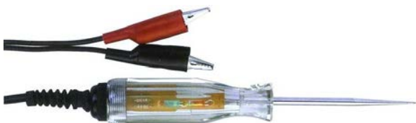
LMCTS-008 LED CIRCUIT TESTER