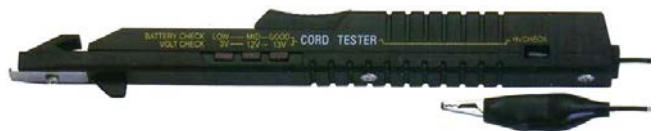
LMCTS-038 AUTO CORD TESTERE W/CE