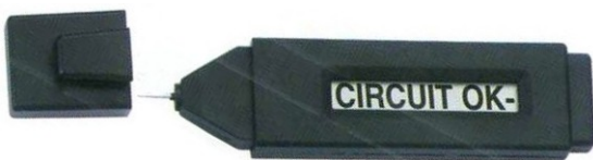
LMCTS-033 POLARITY CORDLESS CIRCUIT TESTER CHECKS FROM 6 TO 28V, LCD DISPLAY SHOWS POLARITY