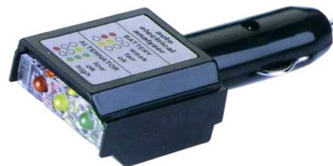
LMCTS-041 AUTO BATTERY AND CHARGING SYSTEM ANALYZER