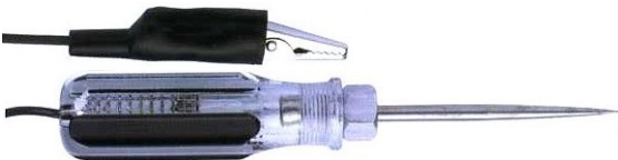
LMCTS-019 CIRCUIT TESTER CHECK 6-12-24V SYSTEM W/CE