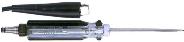
LMCTS-018 HEAVY DUTY CIRCUIT TESTER CHECK 6-12-24V SYSTEM W/CE