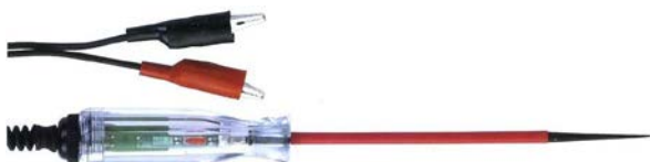
LMCTS-009 LED LONG PROBE CIRCUIT TESTER